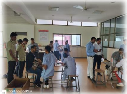
HEALTH CHECK-UP CAMP