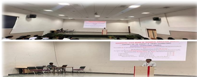
MSBTE Exam Pattern Discussion