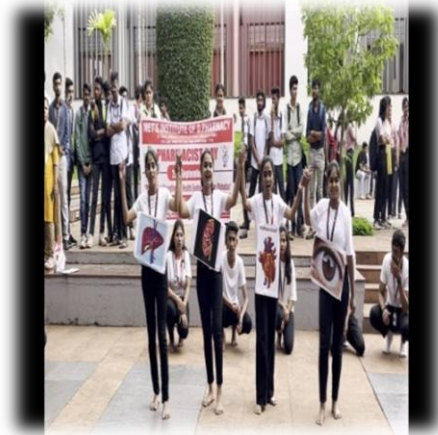
Flash Mob to Promote Organ donation