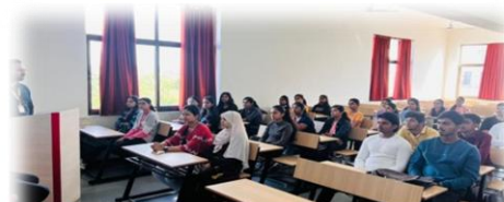
Brief on MET IODP Activity