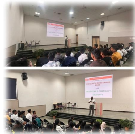
Lecture on Communication Skill & Personality