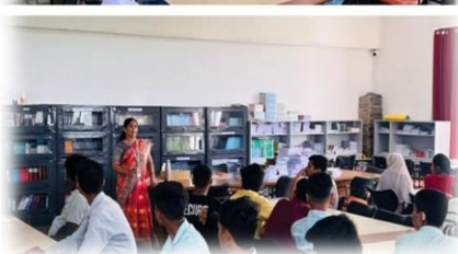
Rules & regulation of Library & IODP Campus Introduction