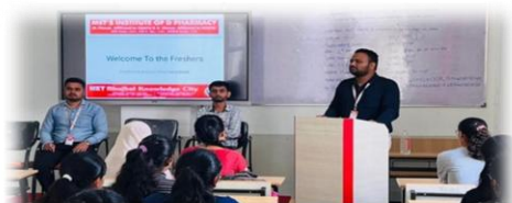
Welcome note & Schedule Discussion for Induction Programme