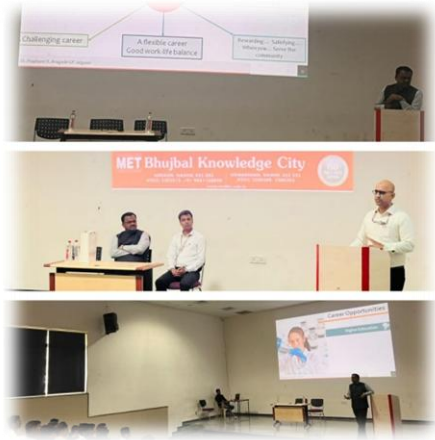
Expert Lecture on Career & Opportunities After D.Pharmacy