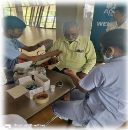
Blood donation camp