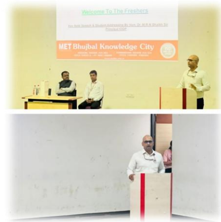
Student Addressing & Key Note Speech