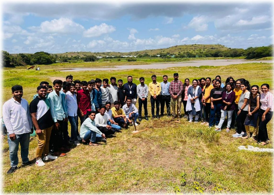
TREE PLANTATION BY IODP STAFF AND STUDENTS