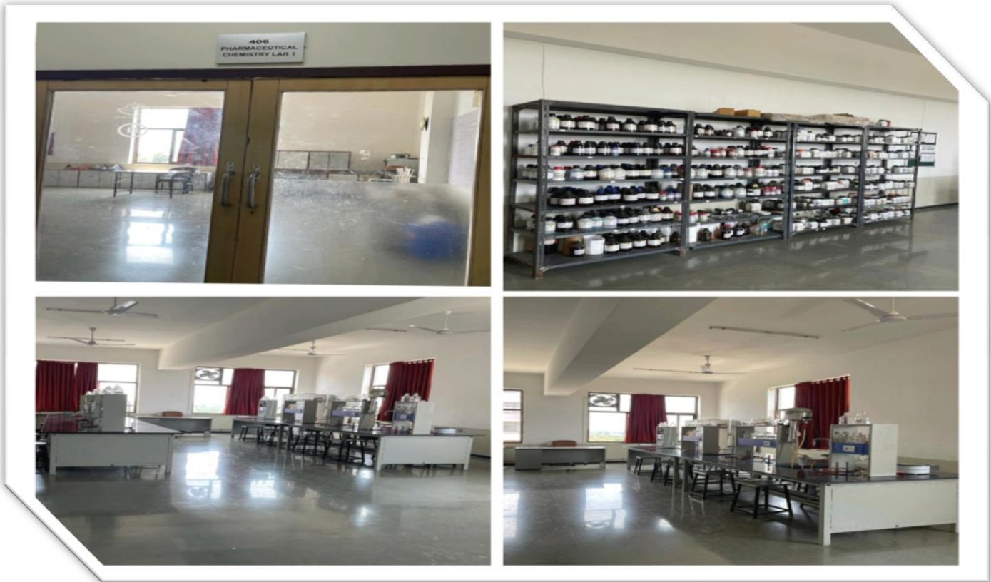
Pharmaceutical Chemistry Lab