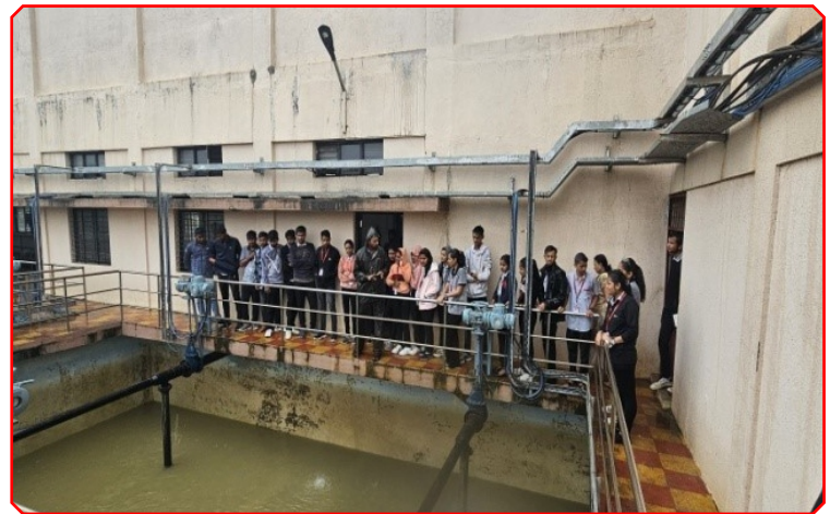
Visit to Water Treatment Plant, Nilgiri Bag, Nashik 8 th September 2023