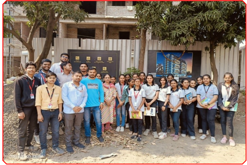
Visit to construction site for plastering, Scaffolding. , Jail road Nashik road 01st November 2023