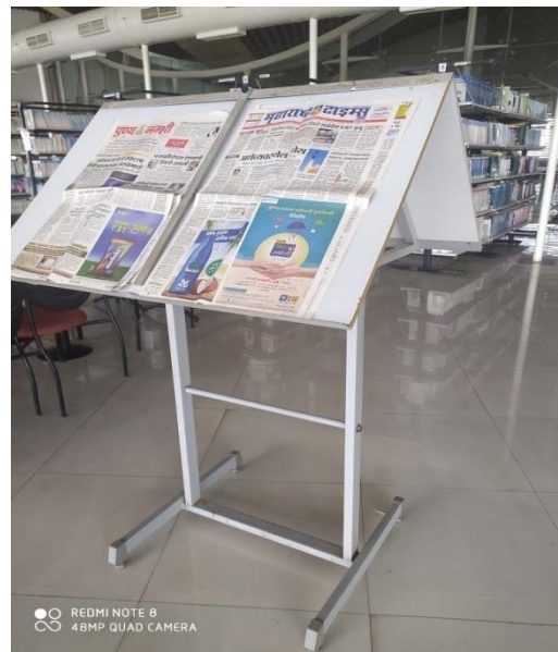
Newspaper Reading Section