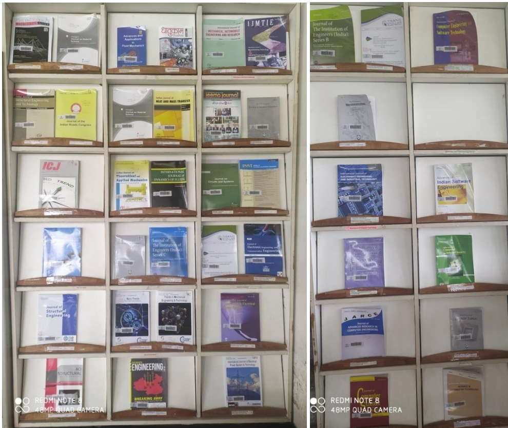
Journal /Magazines Section