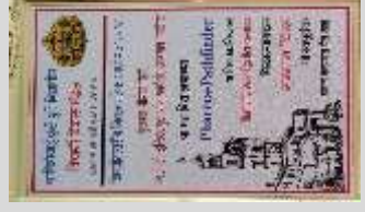
Best Magazine Award 2017 & 2019

MOUs with Industries, Hospitals & Institutes