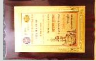
Appreciation Award to NSS unit