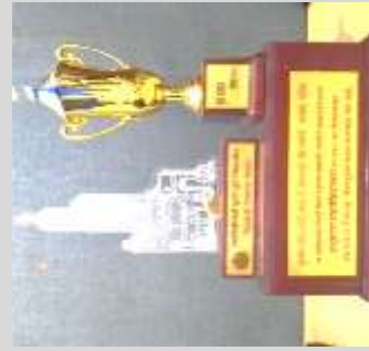
Best College Award, Student Development Board, SPPU