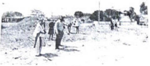
Guidance by Kumawat Sir on snake ( सर्पमित्र )