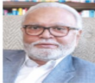
Hon. Mr. Chhagan Bhujbal Chairman, Mumbai Educational Trust