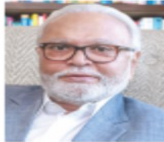
Hon. Mr. Chhagan Bhujbal Chairman, Mumbai Educational Trust