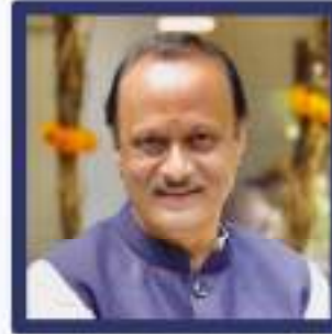
Shri. Ajit Pawar