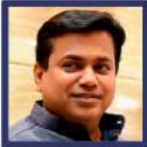
Shri. Uday Samant

Hon'ble Minister Higher & Technical Education