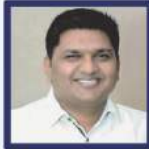
Shri. Prajakt Tanpure

Hon'ble Minister Higher & Technical Education