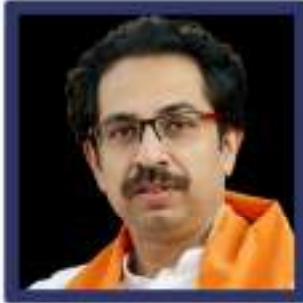
Shri. Uddhav Thackeray