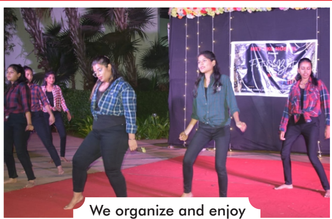
We organize and enjoy