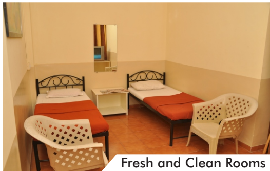
Fresh and Clean Rooms