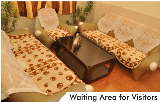
Waiting Area for Visitors