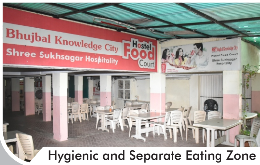
Hygienic and Separate Eating Zone